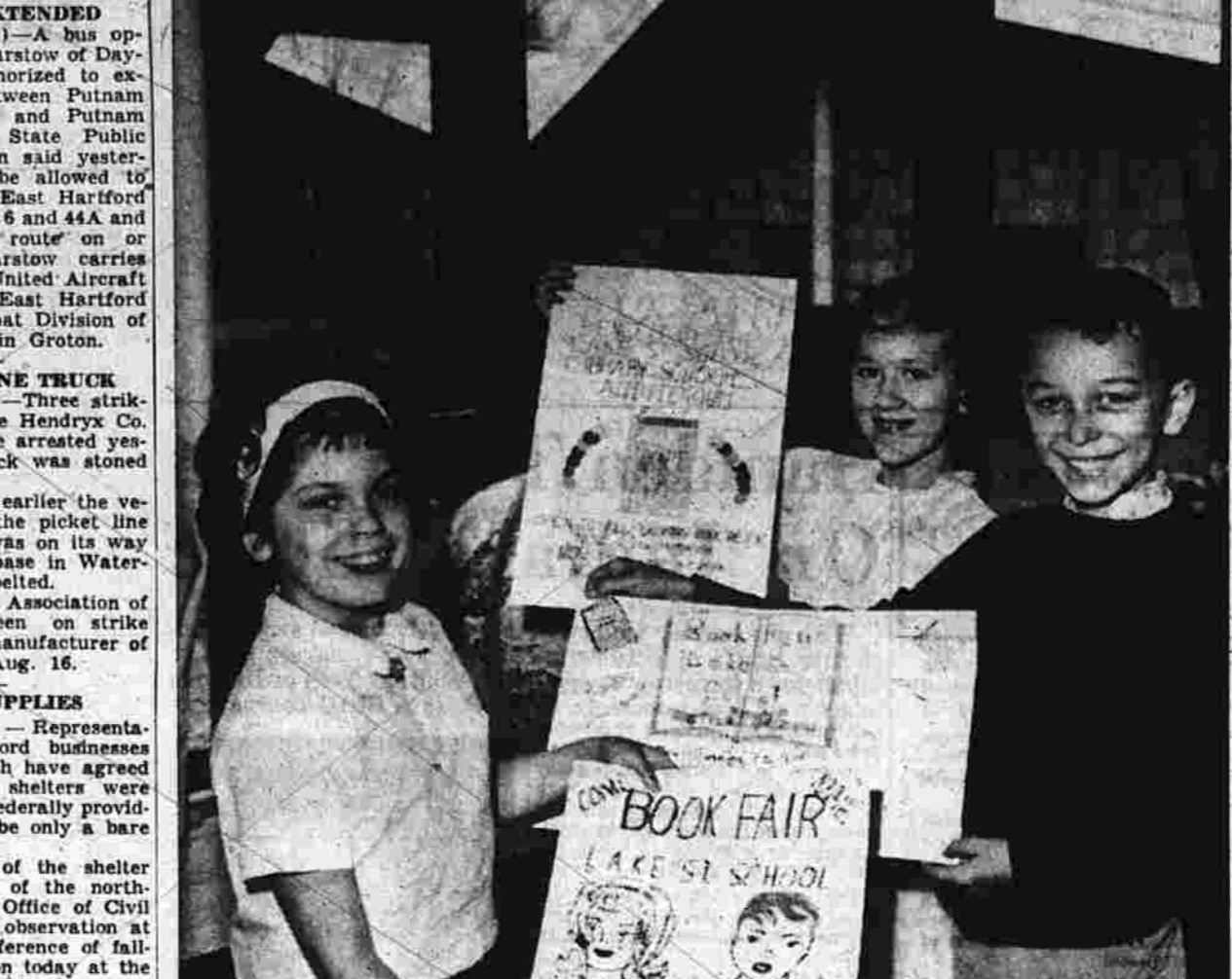
Winners All in Book Fair Contest